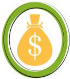
Monthly Savings of Clients Retained for 6+ Months

High utilizers are the top half of clients who filed a claim