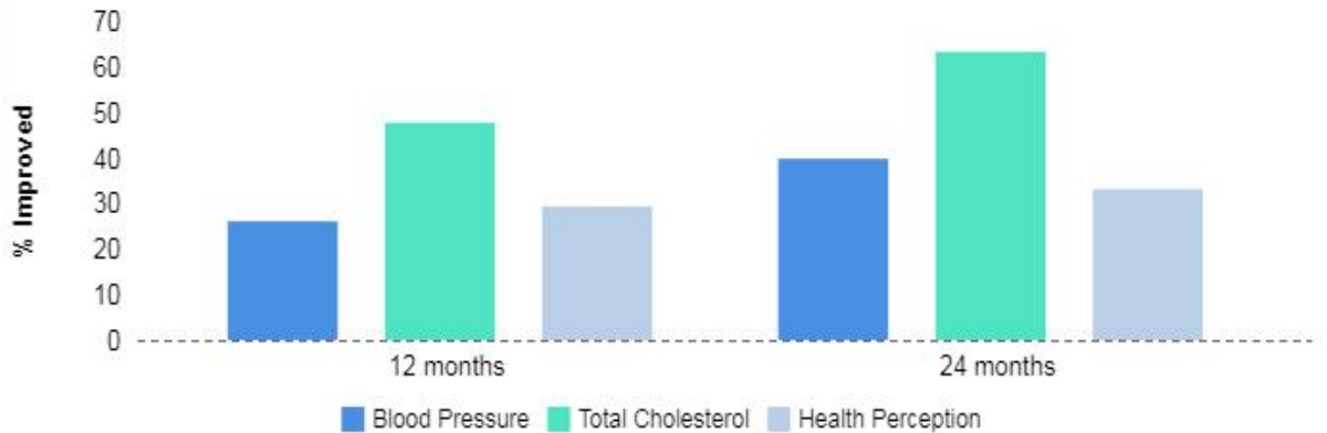
At-Risk Clients Psycho/Social Improvements*